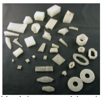
(Photo of some of the ethafoam scraps and shapes found most useful)