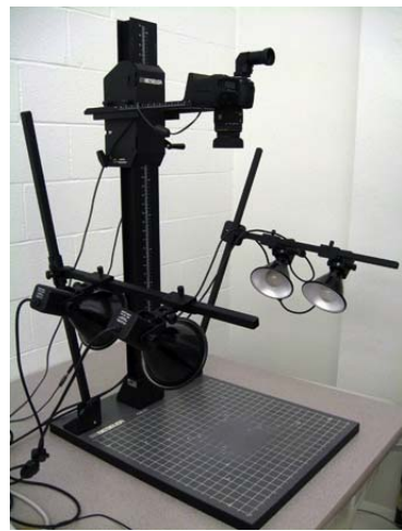
(Photo of copy stand with arms holding 4 lights with reflectors) [Replacement lights, etc. available from B&H Photo]

• GE or Osram-Sylvania Frosted Photoflood light bulbs [ECA, 250W, 3200° K] (used to help set white balance)