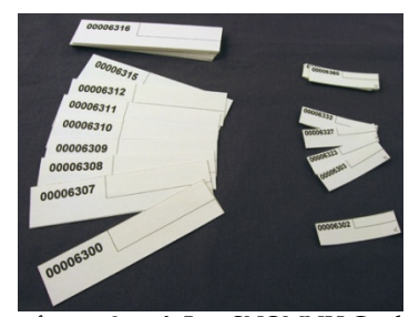
(Photo showing examples of some 2cm & 5cm SNOMNH Cardstock Specimen Numbers) [The Collection uses bold 20-point Arial font to type the numbers]

• Laminate Pouches & Laminating Machine (to laminate cardstock scale bars for longer durability)