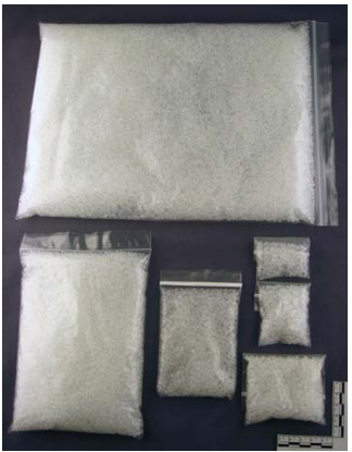
(Photo of zip top bags sizes found most useful containing Poly-Pellets®)

• Zip Top Bag - Various sizes (used to hold Poly-Pellets®)