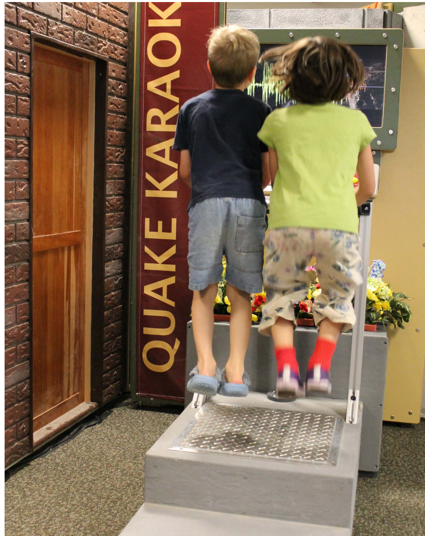
Two children jump on a sensor to mimic the force of an earthquake in “Quake Karaoke.”

“When the Earth Shakes” is on display through Jan. 2, 2017. The exhibit is locally sponsored by Love’s Travel Stops and Country Stores.