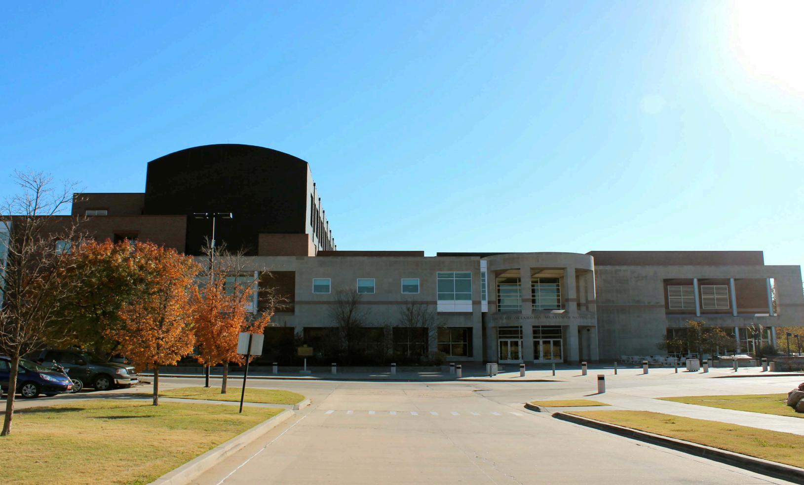
The museum on a sunny fall day.

Next year will mark the museum's 30th anniversary as the state's natural history museum. The Sam Noble Oklahoma Museum of Natural History will endure. It will continue to protect the state's heritage, educate students to be tomorrow's researchers, display Oklahoma's unique story to visitors from around the world, serve Oklahoma's students by making them more aware of the state's natural world and its history, and serve the people of Oklahoma with opportunities for lifelong learning, entertainment and quality family time.