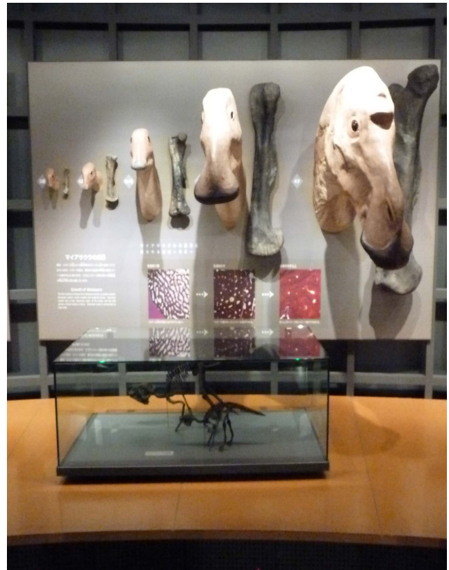
Above: Part of the extensive display in “The Great Journey of Dinosaurs” exhibit in Katsuyama, Japan.