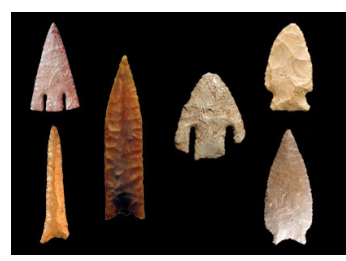
Projectile Points, SNM Collection

In response to the pandemic, the staff of the archaeology department has been working from home since March and remains as focused as ever. We continue to make progress on our active NAGPRA projects, collections management duties, as