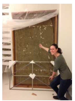
Ella Crenshaw cataloging Class Period Stelae (MEX00022/007.002)

Legacy collections are the unprocessed materials and returned loans that are separated from their associated collections. They are a pervasive problem in museums today. There are far greater issues the museum world faces (e.g., funding, relevance, etc). This spring, undergraduate intern Ella Crenshaw completed an inventory of the legacy collections, keeping track of their location, associated information and processing status.