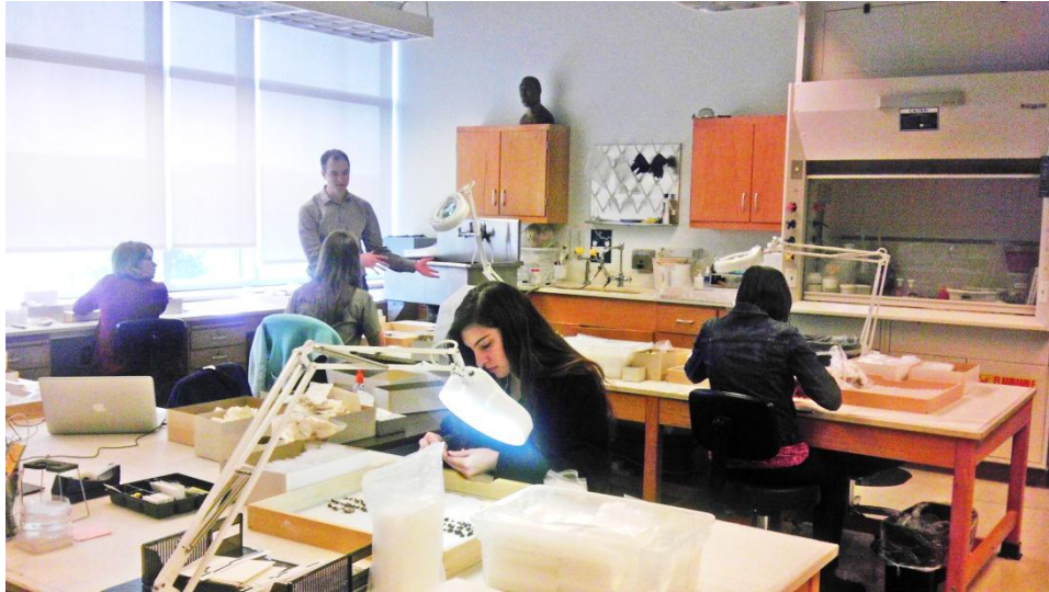
Interns working in the archaeology lab