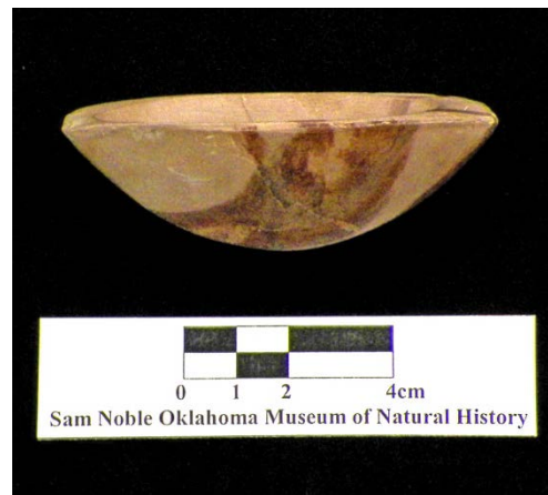
Engraved shell, stone earspool, and polished boatstone from Spiro Mounds.

Visit our new blog, http://samnoblearchaeology.wordpress.com/ , for more info on the project!