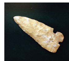
Corner Tang Knife Ravenscroft collection (USA00038/001.062)

The archaeology department recently accessioned a collection of 718 artifacts primarily from western Oklahoma. Roy Bruce "R.B." Ravenscroft collected these artifacts from the 1920s–1950s. A large portion are corner tang knives, which were Ravenscroft's prized possessions.