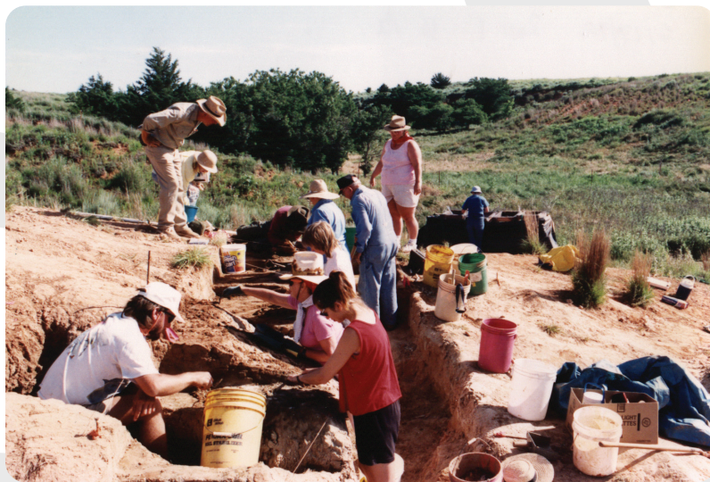
The Burnham site yielded finds that called into question a generation of archaeological assumptions.

he taught regularly is one called "Great Discoveries in Archaeology" for freshmen and sophomores. He takes satisfaction in knowing that this survey class has been the inspiration for at least six of his students to decide to become archaeologists themselves.