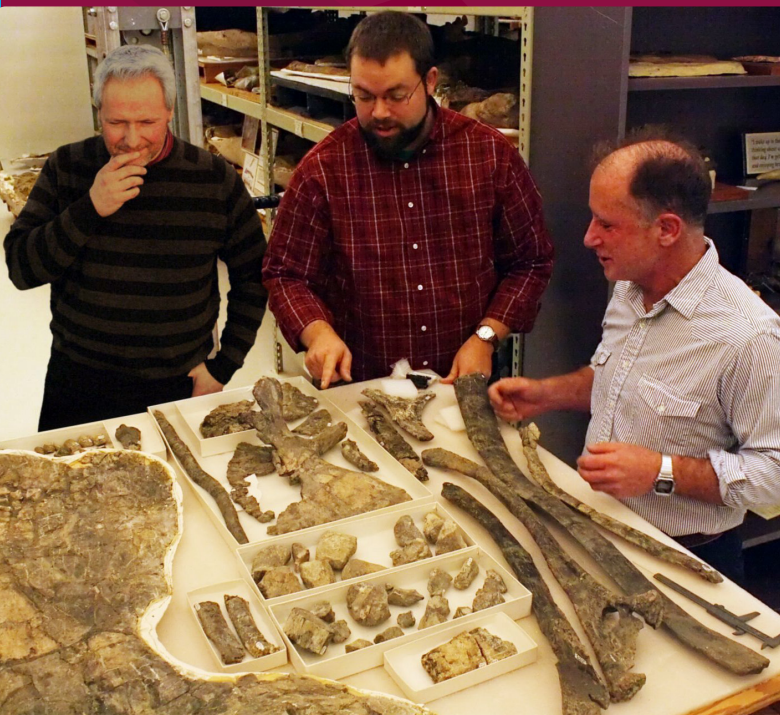
COLLECTIONS PAGES: 6-7