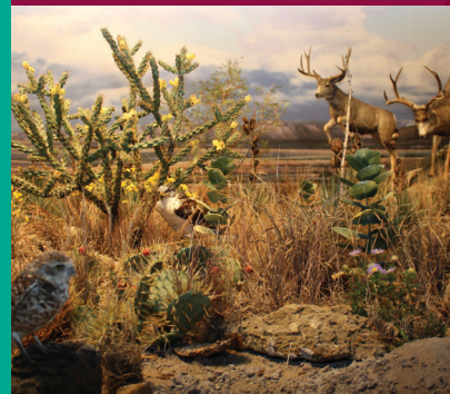
EXHIBIT: PAGES 4-5