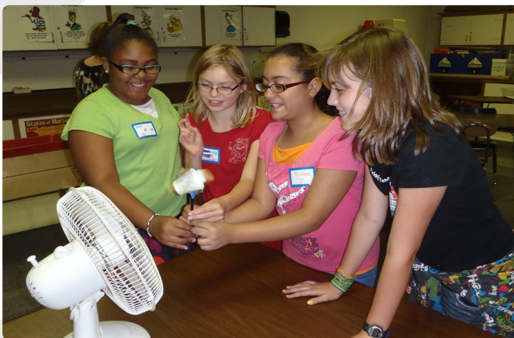
Participants in the Sci Girls program at Irving Middle School conduct a wind experiment.

teachers focusing on teaching science through outdoor investigation. The one-day program will take place on Saturday, April 30. Information about registration is available on the museum's website.