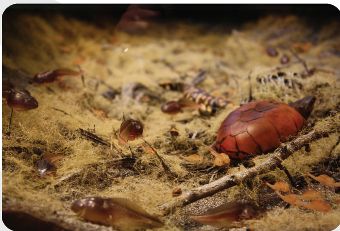
Turtles, tadpoles and fairy shrimp can be found in the exhibit's seasonal pond.

habitat of the Oklahoma panhandle. Designed to simulate a seasonal stream shaded by enormous cottonwood trees, the exhibit features plants and animals native to the arid environment of Black Mesa as well as those that thrive in the short-lived streams and ponds that appear and disappear with the spring rains.