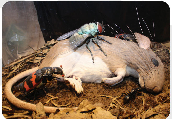
This model of a dead mouse is 12 times actual size. It is the focus of a mini diorama showcasing the unique lifecycle of the American burying beetle. The beetle pairs find a small dead animal such as a mouse or bird, and systematically bury it by excavating the soil from underneath the body. Once buried, the carcass serves first as a safe haven for the beetles' eggs, and later as a food source for the adults and their newly hatched larvae.

The exhibit is chock-full of specimens and facts: more than 150 animals and 57 species of plants are represented. Touch screen displays allow visitors to dig deeper for information, including recordings of the calls of birds and frogs, territory maps for animals, and in-depth information about many of the species represented. Two mini dioramas associated with the exhibit provide in-depth looks at particular stories: the fascinating life cycle of the American burying beetle, and the diversity of life associated with year-round rivers and ponds.