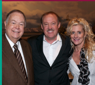
DONATION: PAGE 3