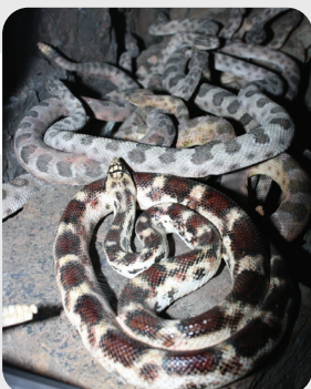
A view into a rattlesnake den shows how the snakes survive through the winter.

Water is scarce on the high plains, and animals that rely on water for part of their life cycle here are adapted to respond quickly when water is available. Some species of amphibians, freshwater shrimp and other animals are able to withstand long periods of drought either by burrowing into the earth or laying eggs that can withstand dry conditions. When the water returns, some of these animals are able to reanimate, breed and reproduce within a matter of days. The plains spadefoot toad can burrow as deep as 15 feet to escape arid conditions, and is able to remain underground for years, waiting for the rains to return.