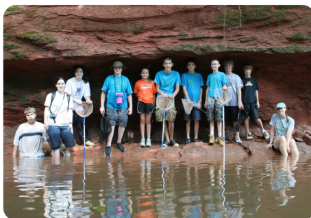
Students in a previous Summer Explorers program pose for a group photo alongside a stream near Norman.