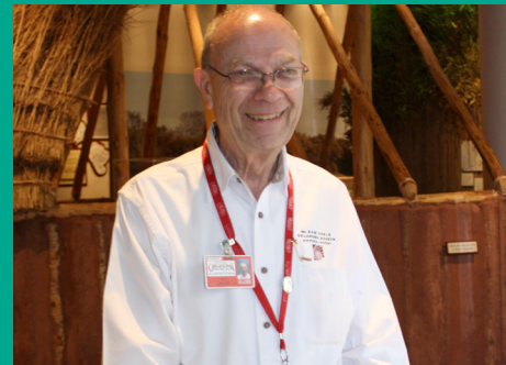
NEWS: PAGES: 12-13