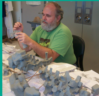
COMING UP: PAGE 11