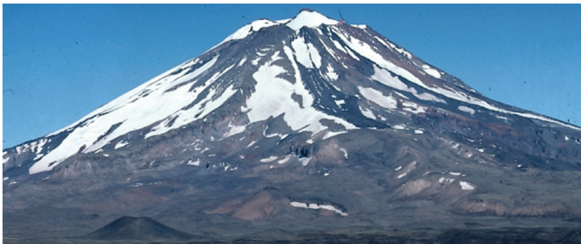
Above: Andes Mountains by Michael Mares

lightning flash in the distance illuminates the cloud mass, huddled at a lower altitude along the wet slopes of the pre-Andean mountains. For more than a hundred square miles, the campfire is the only light burning on this desert island in the sky that comprises the roof of the South American continent. The fire is burning low and there is little firewood remaining, for the nearest trees are more than a three-hour drive away. This is a land with no trees.