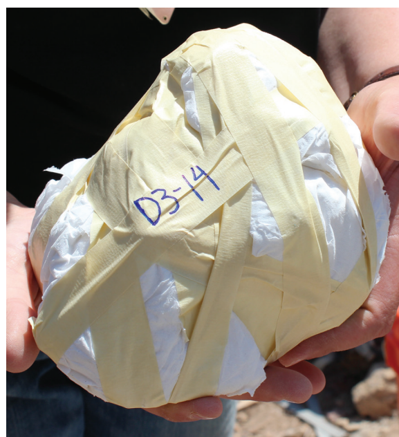
Above: A field jacket of a small section of excavated fossil from the quarry