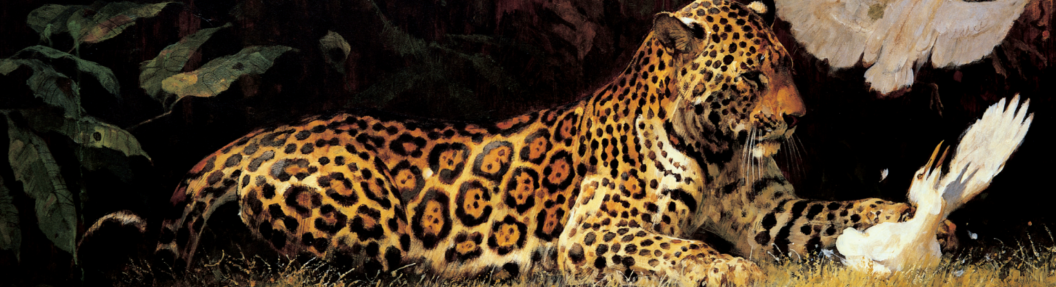
Above: Jaguar and Cattle Egrets (1980)