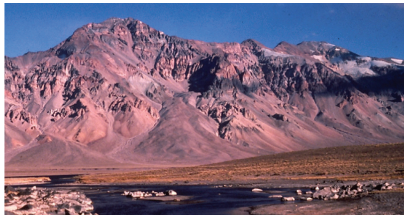
Above: Andes of Argentina