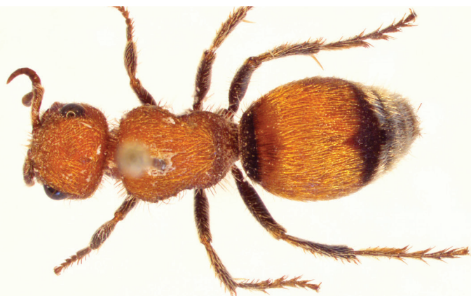
Below: A Pseudomethica as a scientific specimen