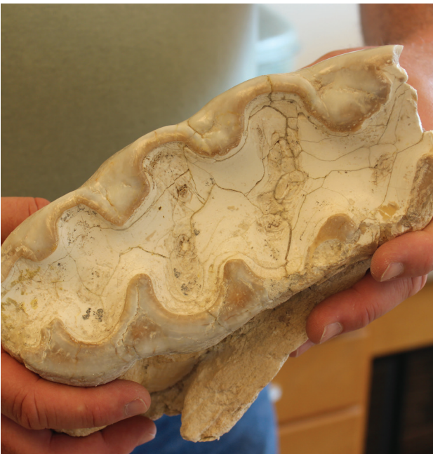
Above: Gomphothere tooth from the Dyack site in far southern Arizona

The original bones rest inside the highly organized walls of a massive collection facility. Here they are protected and available for scientific study, or further replication.