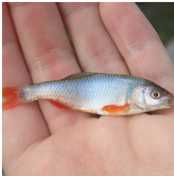
Above: Red Shiner