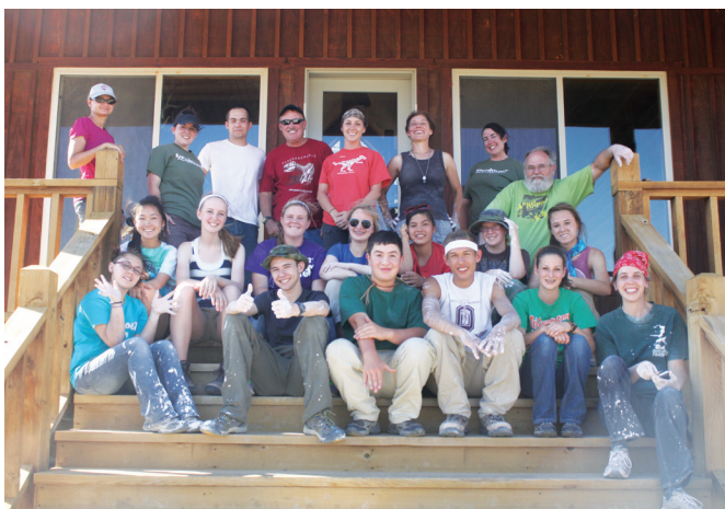
Above: the 2013 Paleo Expedition group