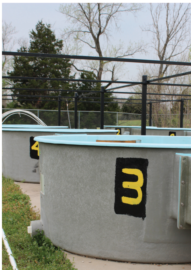
Above: Artificial streams used to replicate natural environments.