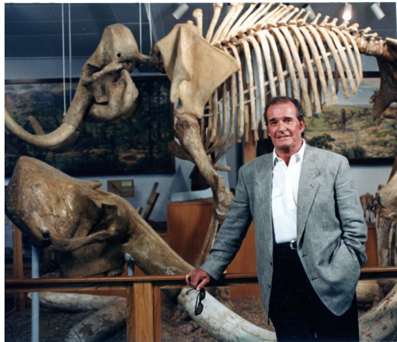
James Garner, pictured in front of a Stovall Museum exhibit during his visit to the museum in summer 1995.