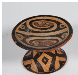
Ceramic Pedestal Bowl