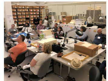
Artifact Blitz Training

This fall, the archaeology department hosted its first Artifact Blitz with the Oklahoma Anthropological Society. Over two days, 16 volunteers assisted with labeling boxes and specimens, inventorying current collection items, preparing specimens for long-term storage, making box dividers and archiving documents. Many of the volunteers were local, but a couple of them traveled from Tulsa and one even traveled all the way from Arkansas (375 miles)!