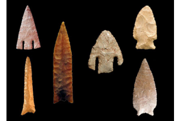
Projectile Points, SNM Collection

In response to the pandemic, the staff of the archaeology department has been working from home since March and remains as focused as ever. We continue to make progress on our active NAGPRA projects, collections management duties, as well as various reports and paperwork. If all goes well, we hope to have a limited number of staff members back in the museum later this summer.