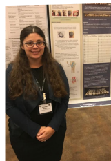
AAPA meeting in Austin, TX in 2018